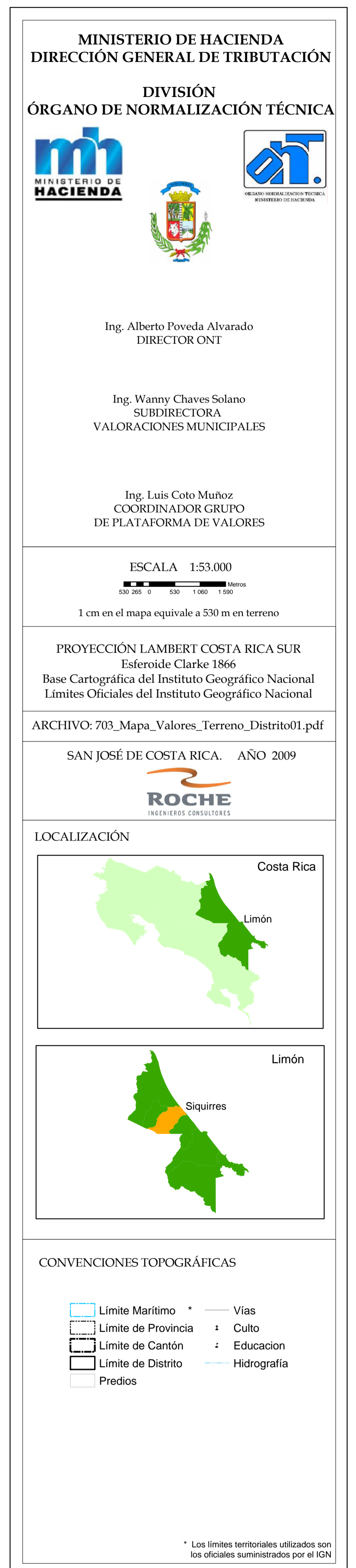
MATRICES DE INFORMACIÓN DEL MAPA DE VALORES DE TERRENO POR ZONAS HOMOGÉNEAS